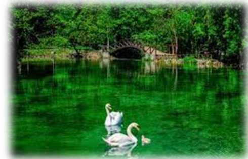
BOSNIA RIVER SPRINGS

Dinner and overnight at hotel in Sarajevo.