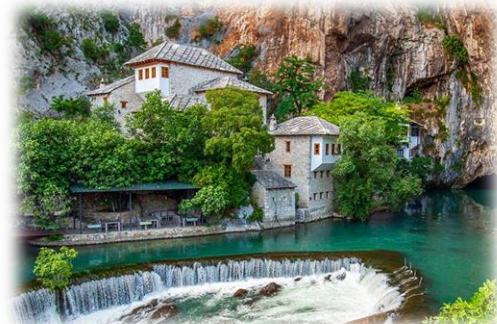
BLAGAJ AND BUNA RIVER SPRINGS