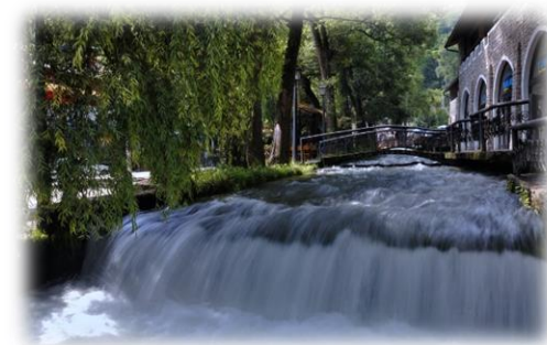
TRAVNIK BLUE WATER

Dinner and overnight at hotel in Travnik.