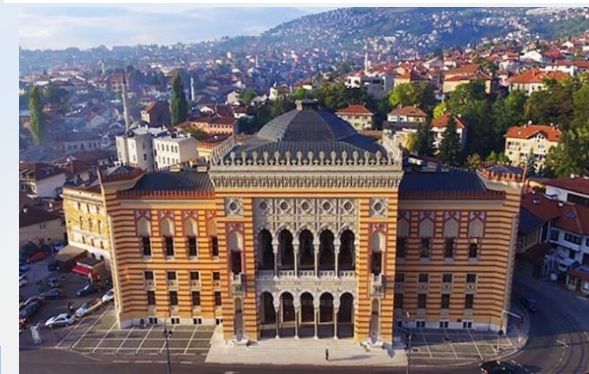
Sarajevo city hall