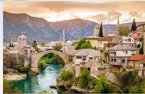
Mostar old bridge