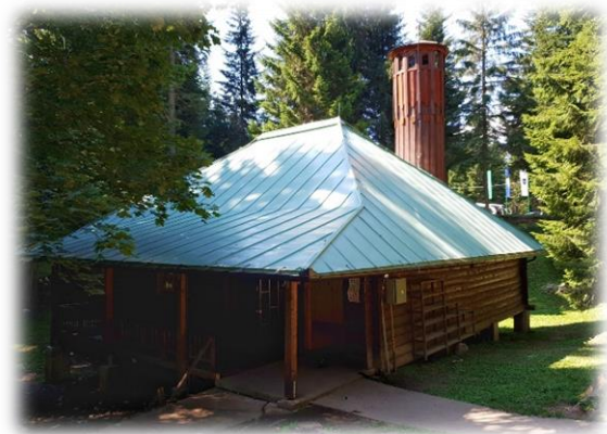
IGMAN WAR MOSQUE

Lunch at local restaurant in Sarajevo. Overnight at hotel in Sarajevo.