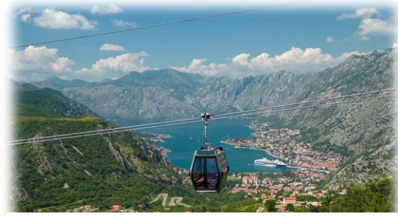
KOTOR CABLE CAR