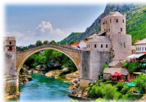
MOSTAR OLD BRIDGE